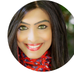
Latha Sambamurti Washington State Arts Commissioner