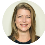
Member at Large Angela Birney Mayor of City of Redmond